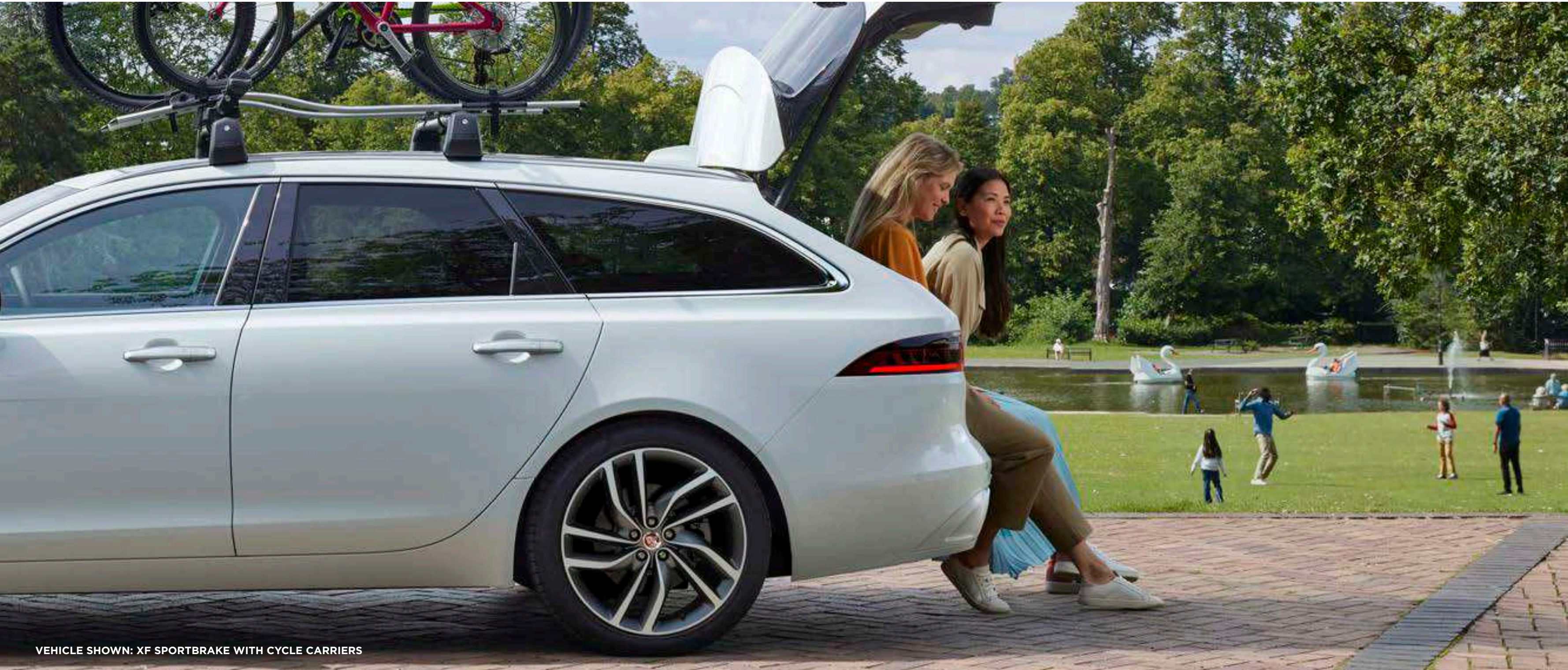
VEHICLE SHOWN: XF SPORTBRAKE WITH CYCLE CARRIERS