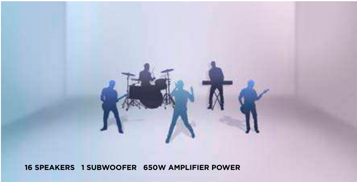
16 SPEAKERS 1 SUBWOOFER 650W AMPLIFIER POWER

Brings detail and clarity to everyone in the car with strategically arranged speakers and a dual-channel subwoofer to deliver a full, sophisticated sound.