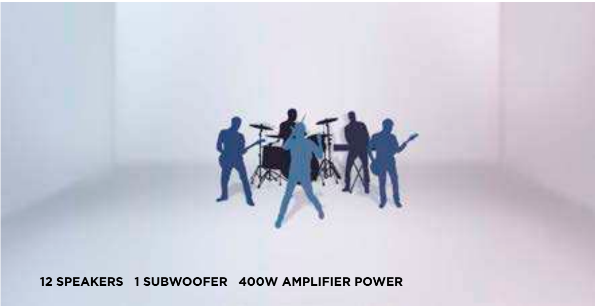
12 SPEAKERS 1 SUBWOOFER 400W AMPLIFIER POWER

Gives new levels of realism to your favourite music with a combination of speakers, 6-channel amplifier, Audio Equalisation and Dynamic Volume Control.